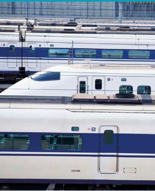
Railroad Control System Europe