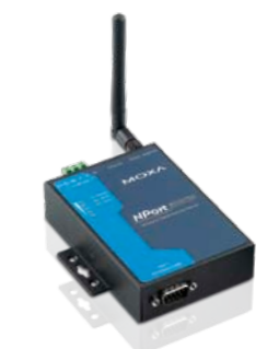
CNC Control System Global